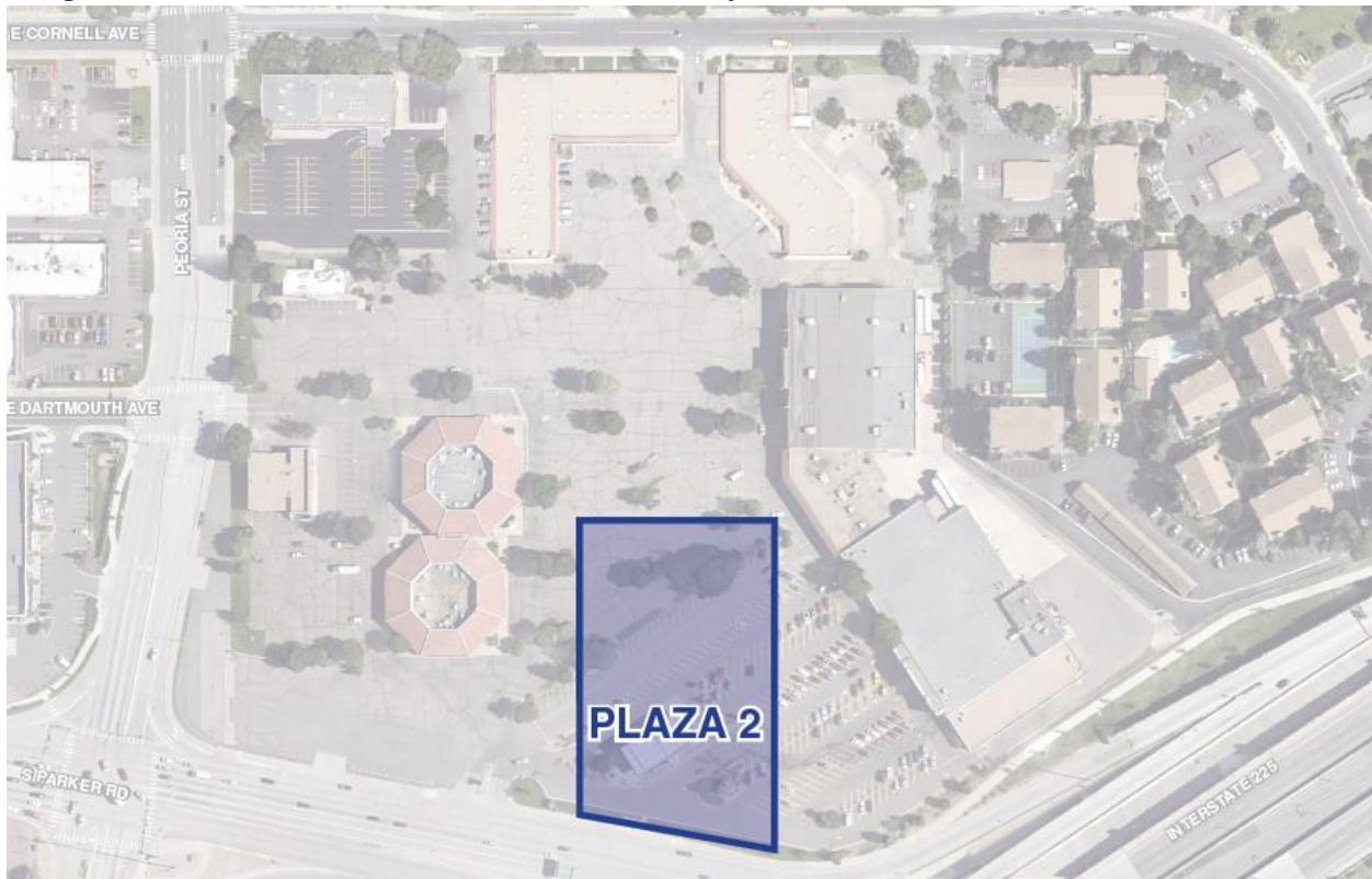
Figure 1. Plaza 2 Urban Renewal Area Boundary